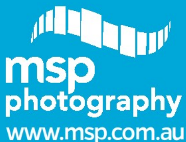
PHOTO DAY IS COMING ....